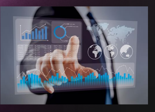
High quality interactions with qualified & targeted leads