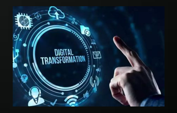
Constantly building content across Digital Transformation and Technology fields

Be our Exclusive Sponsor:RSVP (Ph): +91 89040 78727, 9844344977 | M: info@globalrealestatelagoonsummit.com