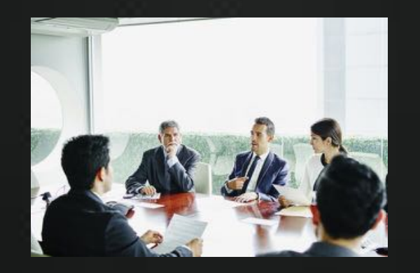
Exclusive access & visibility to attendees.