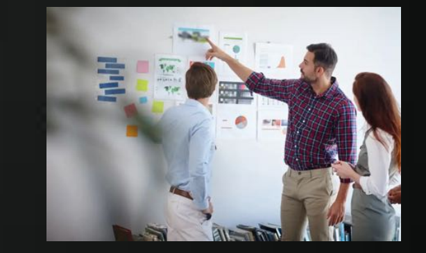
Dedicated delegate acquisition team to ensure targeted Leads